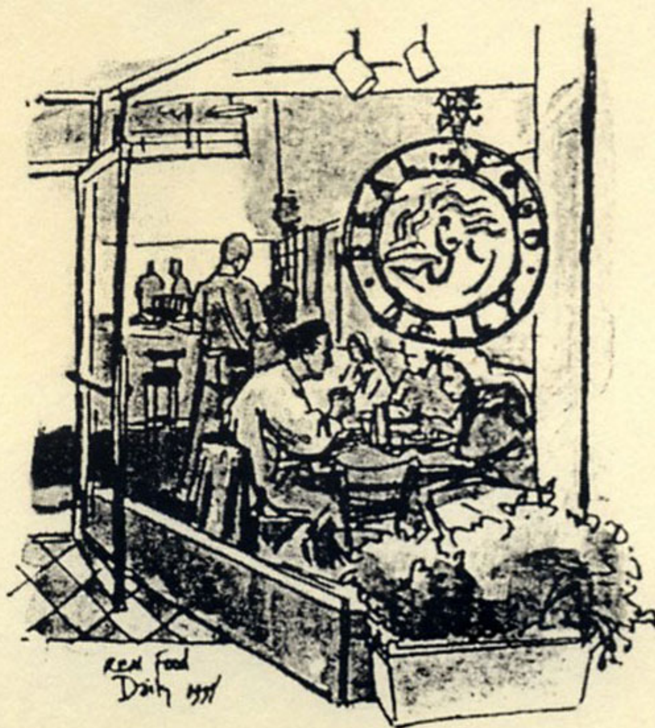
BABES: The pure ones line up at Real Food Daily in Santa Monica for Alice Waters-like vegan fare